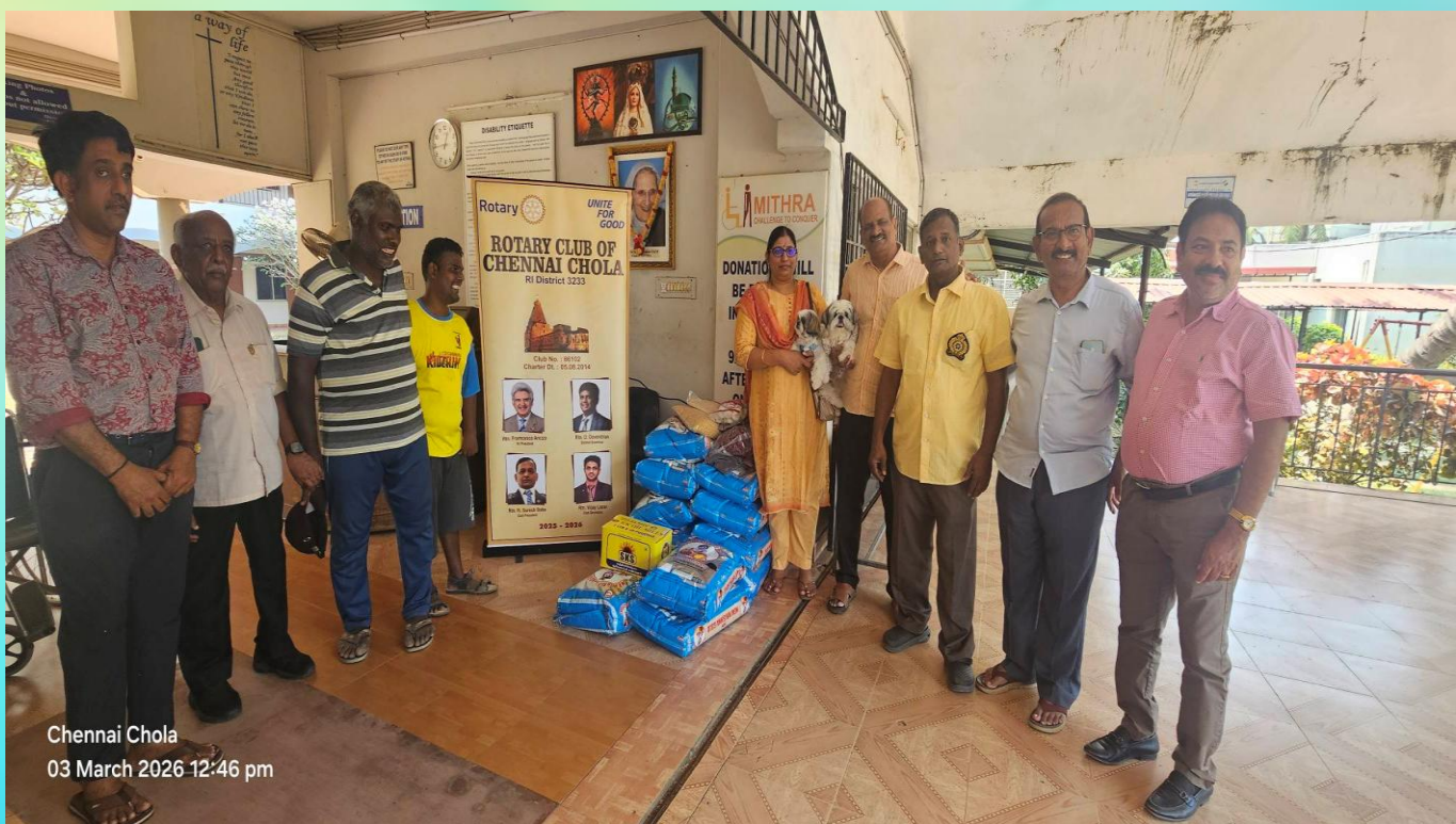
Chennai Chola 03 March 2026 12:46 pm