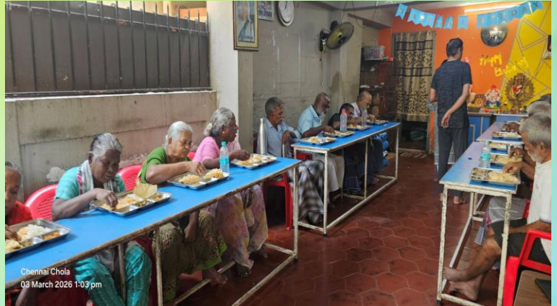
Chennai Chola 03 March 2026 1:03 pm